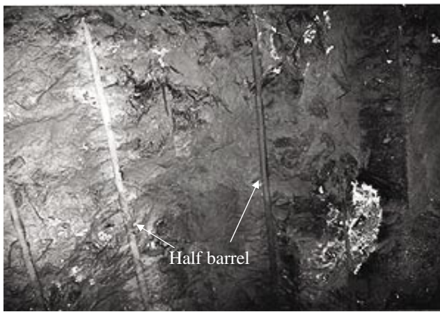
Fig. 4 Example of “half barrel”.

The results of measured weight do not correspond with the results from the status of pipe damage.