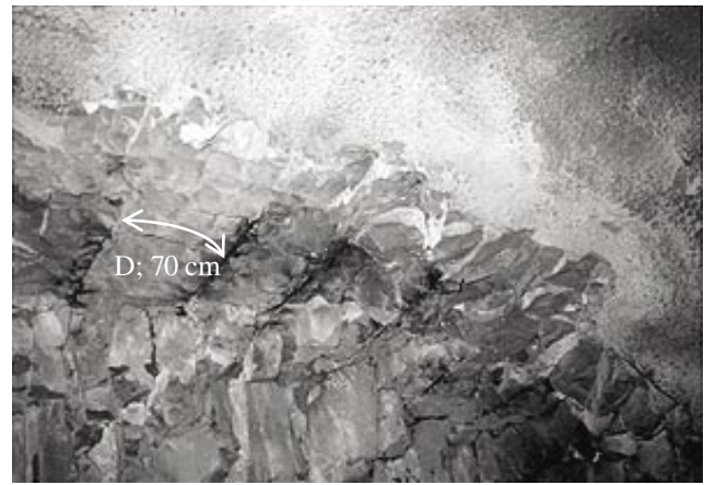
Fig. 5 Example of perimeter wall after blasting.

where r_t is the damage radius in rock [cm], \phi_b is the borehole diameter [cm], \sigma_t is the tensile strength of rock [kgf cm -2 ], D is the spacing that the crack can couple together [cm].