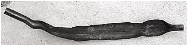
Detonating cord A